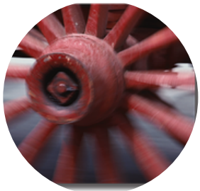
TCL: America's Past