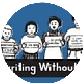
Handwriting Without Tears