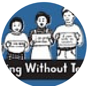
Handwriting Without Tears