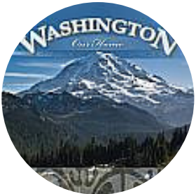
Washington: Our Home