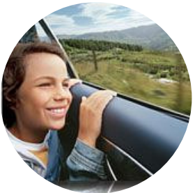
TCI: Our Community and Beyond