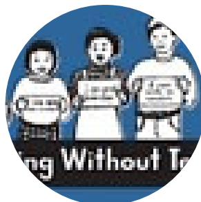
Handwriting Without Tears