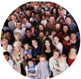
TCL: My Community